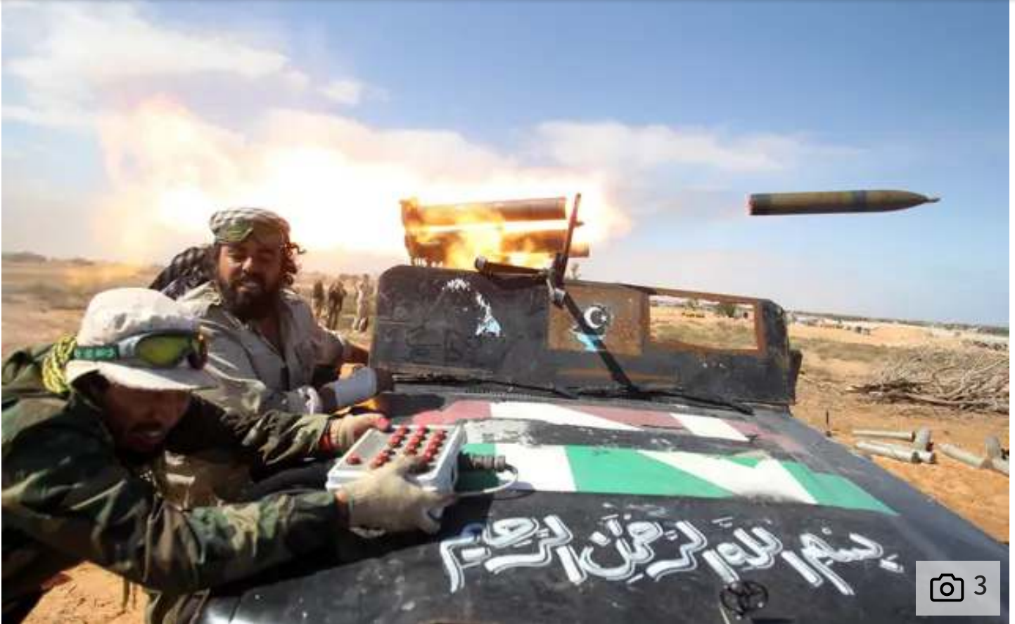
Libyan rebels fire a rocket as they enter the northern city of Sirte, 10 October 2011

Norway became an active member of the Nato bombing campaign, eventually dropping nearly 600 bombs. But at the same time the country's prime minister Jens Stoltenberg, who is now Nato's secretary-general, asked foreign minister Store to continue the top secret talks, hosting them in Norway.